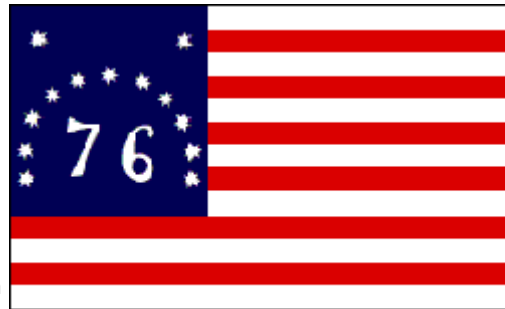
The Bennington Flag of the Vermont Militia.

- Edward Rutledge, Arthur Middleton, and Thomas Heyward, Jr., the other three South Carolina signers, were taken by the British in the siege of Charleston. They were carried as prisoners of war to St. Augustine, Florida, where they were singled out for indignities. They were exchanged at the end of the war, the British in the meantime having completely devastated their large landholdings and estates.